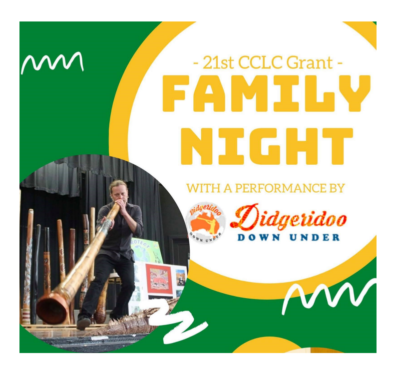
Virtual Family Night